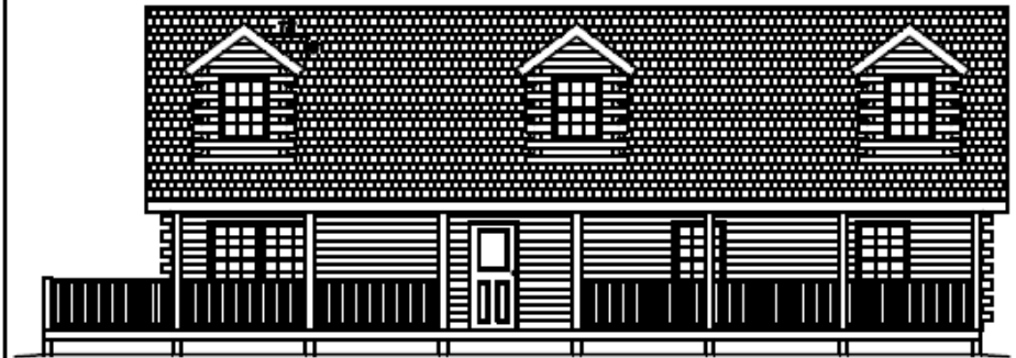
FRONT ELEVATION 1/8" = 1'-0"