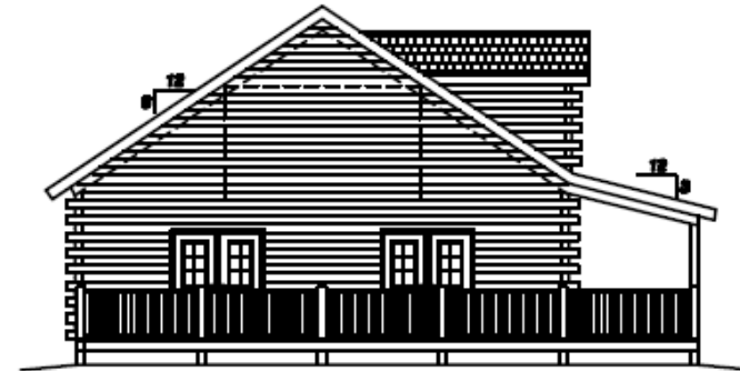
SIDE ELEVATION 1/8" = 1'-0"