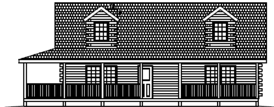
FRONT ELEVATION 1/8" = 1'-0"