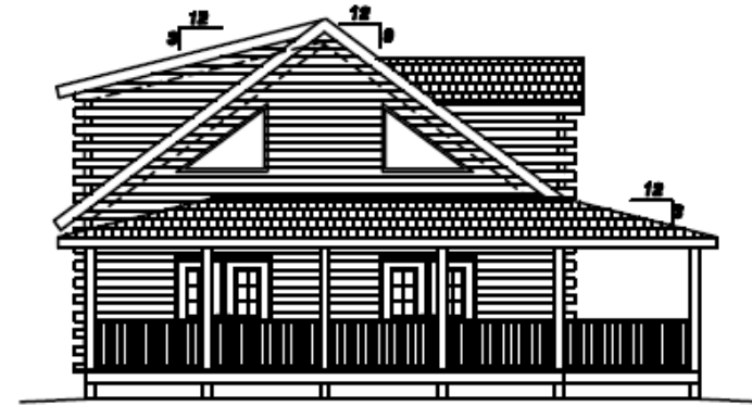
SIDE ELEVATION 1/8" = 1'-0"