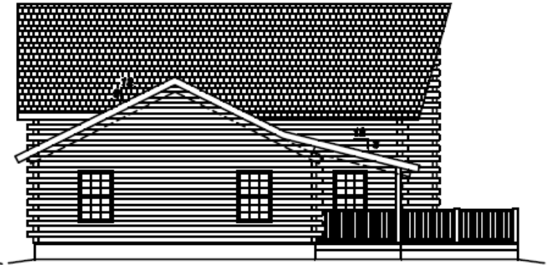
SIDE ELEVATION 1/8" = 1'-0"