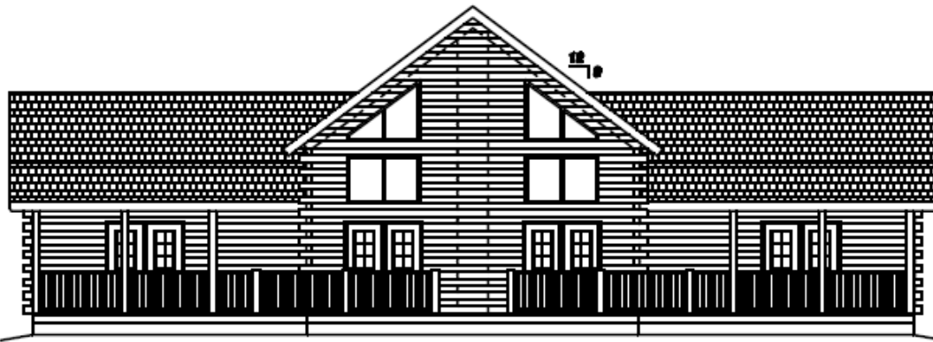
FRONT ELEVATION 1/8" = 1'-0"